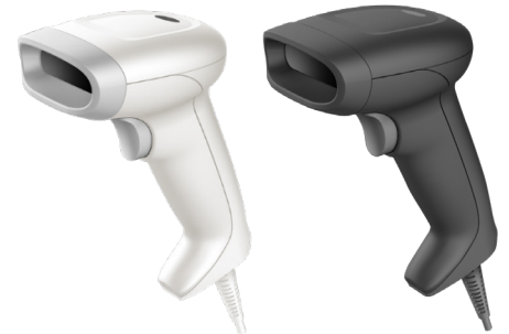
Voyager 1350g is an affordable 2D Area imager scanner

Voyager 1350g supports all popular 1D and 2D barcodes, as well as image capture capability. Incorporating latest technology from Honeywell, Voyager 1350G is easy to install and configure, the user being able to quickly select configurations and personalize the scanning experience. Voyager 1350G is compatible with Honeywell's advanced EZConfig and support all common POS drivers, being ready to adapt to different applications and requirements.