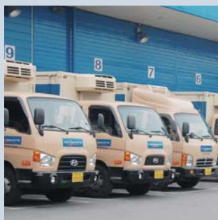
<Food & Beverage>