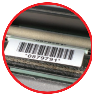
Amazing peel-off model performs on labels just 10mm high