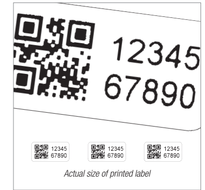
Ultra-high 600 x 1200dpi resolution using a microstep drive control system