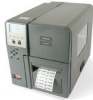
DESIGN:HUTDO.LUK - JUN734