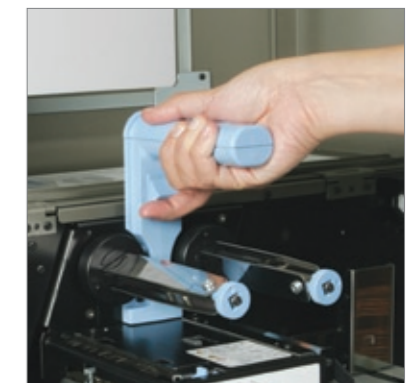
Vertical lifting head unit for easy access