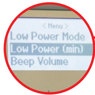
User-friendly and informative large LCD read-out