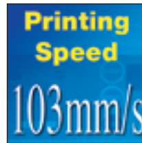
"Fastest" mobile printer in the market!