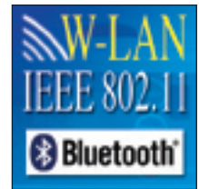
Wireless connectivity option with LCD display