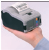
Sturdy, yet sleek and ergonomic that fits in your hand

MB200i is equipped with factory-installable sturdy rubber housing. The ruggedized design makes these printers ideal for high-usage, high-impact applications.