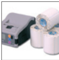
Lasting battery operation due to newly adopted battery cell technology