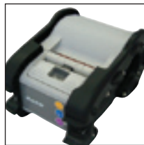
Impact resistant: extra protection against shock, drops and mishandling